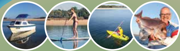
The sheltered environment of the Nambucca River offers a wide range of water-based activities to be enjoyed all year round.