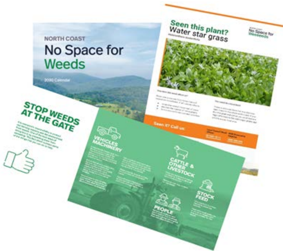
Figure 2: No Space for Weeds campaign examples