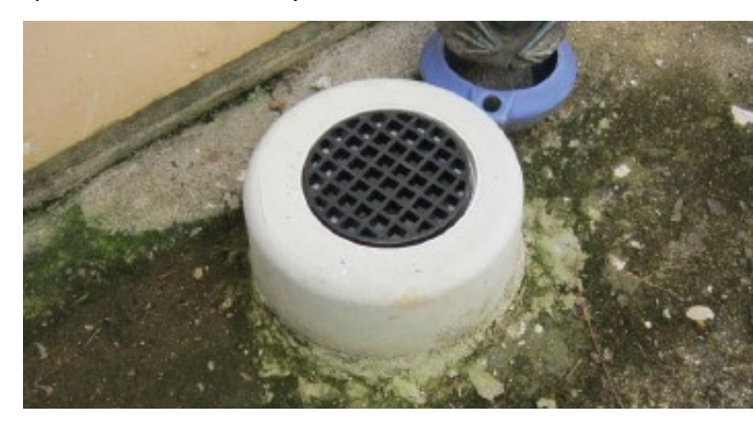
Overflow relief gully

If the ORG cannot be raised to its correct height, an inflow prevention device may need to be fitted to it.