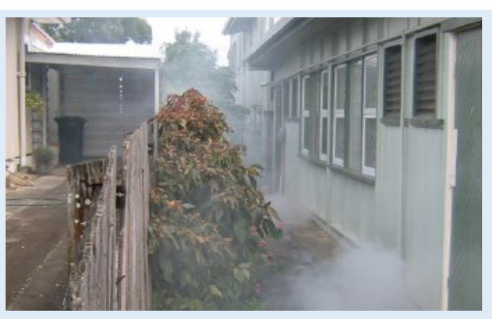
Smoke testing used to pinpoint the places where stormwater is entering the sewerage network.

When we identify an illegal or inappropriate stormwaterto-sewer connection on private property, we notify the property owner and advise where repairs are required.