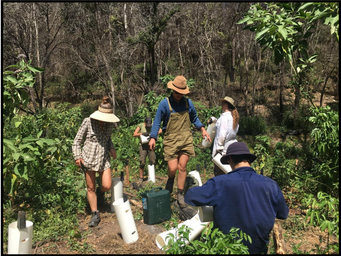
Landcare volunteers at work following bushfires - 2019

Develop management plans for environmentally sensitive areas.