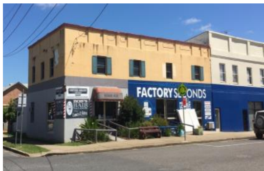
No. 8 Princess Street. From this...

This project was an initiative of the Nambucca Valley Council Business Advisory Committee to revitalise the main streets of Macksville following the highway by-pass of the town. Using a $150,000 NSW Stronger Country Communities Fund grant and matching contributions from building owners, a number of verandahs and awnings were rebuilt to replicate those which over time have been removed from heritage buildings. Updating the tired building facades, painting murals, updating/refurbishing heritage buildings and creating beautiful public spaces has boosted the morale of the community and promotes the town as great places to stop, shop or stay.