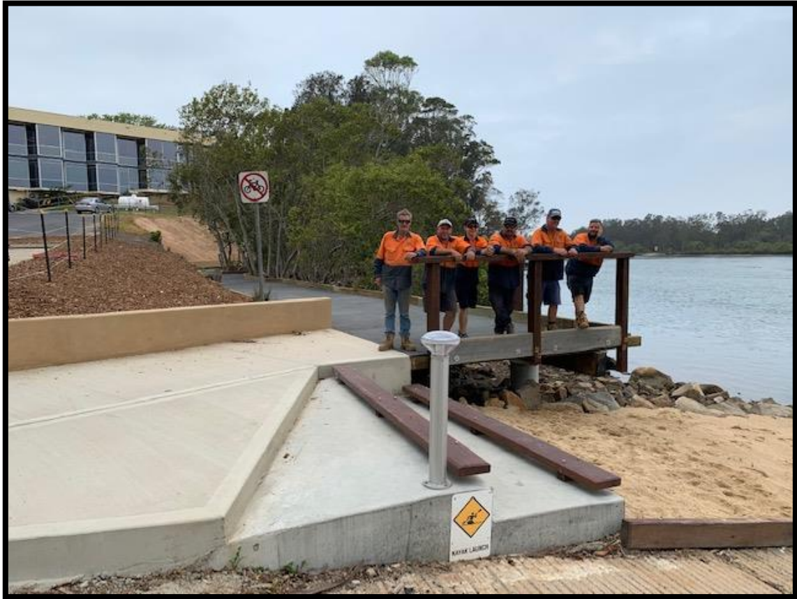
Water craft launch site at Nambucca Heads constructed by Council staff - 2019