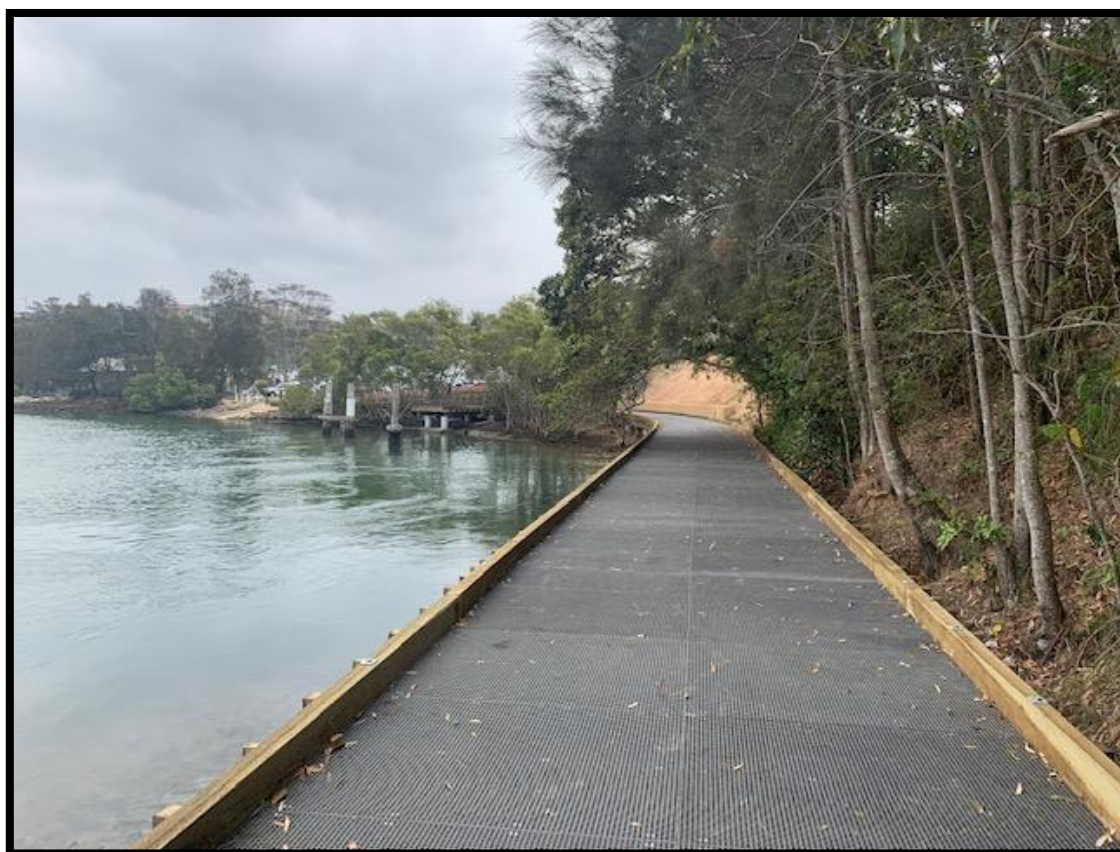
New Riverside Boardwalk, Nambucca Heads - 2019

Achievements in this area are focussed around being active in the community. A major project to support healthy ageing was the commencement of construction of the Macksville to Nambucca Heads cycle way which is nearing completion. New and wider riverside boardwalks in Nambucca Heads also promote activity.