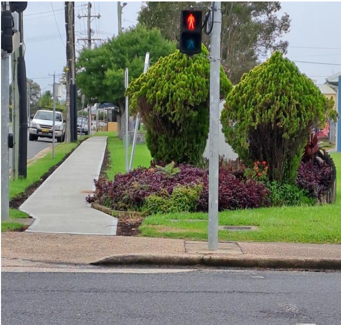
Looking east along Partridge Street.