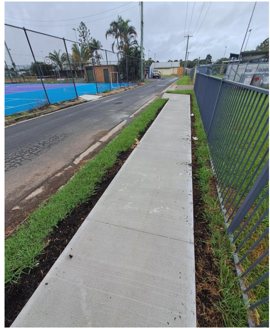
Along Walter Munro Close

Construct a wider footpath along High Street west towards North Arm Road; install 2 gutter crossings to marked pedestrian crossing at Bowraville Central School; ("Bowra07" in the Council's PAMP).