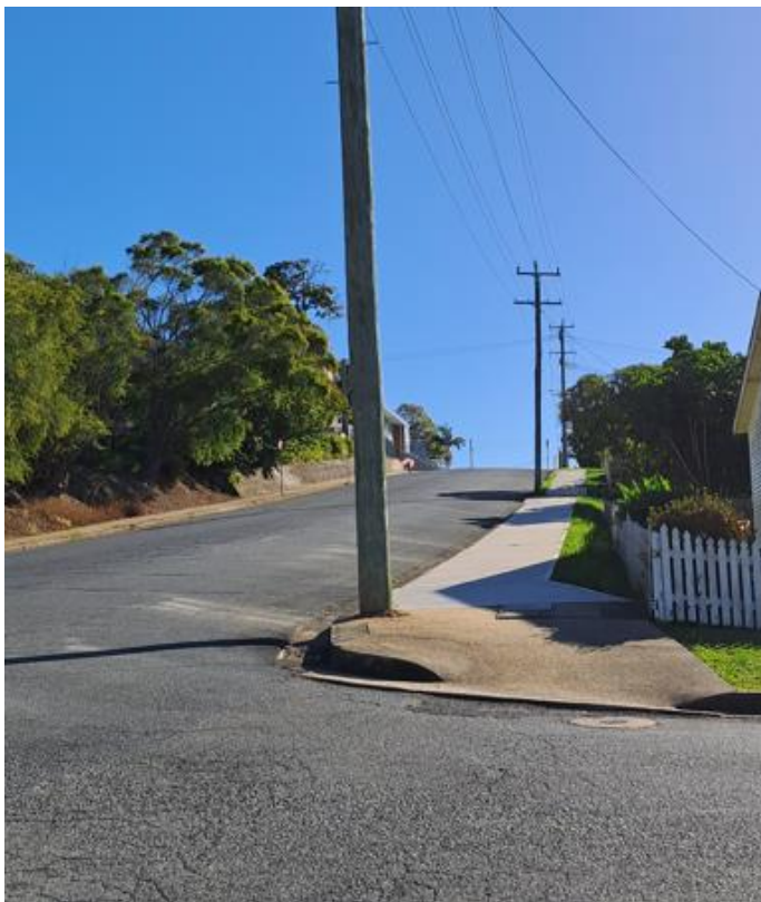
West from Princess St intersection