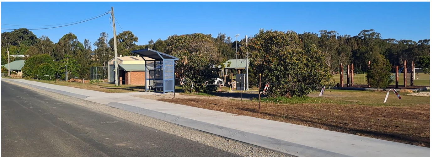
New footpath at Buz Brazil Oval, Vernon Street Scotts Head